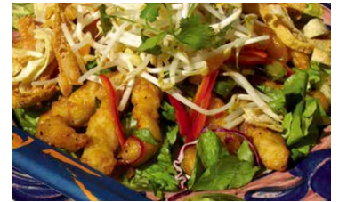
60166- Battered Ginger Chicken Fully cooked w/sauce 8.8lb case | $64.00