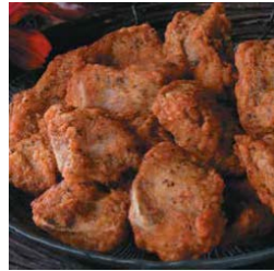
54447-Pork Dry Rib Bone In 10lb case | $80.00