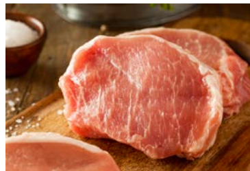
*53565- 6oz Boneless Pork Chops 5lb/case (approx. 13pc) | $38.00