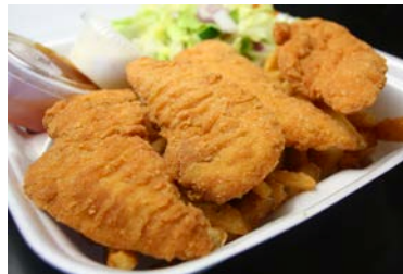
59392- Breaded Chicken Strips 5lb case | $30.00