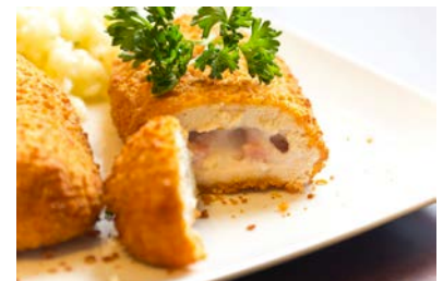
59411- 5oz Chicken Cordon Bleu 30 pieces | $84.00