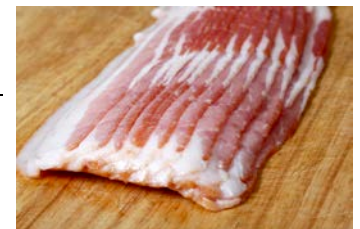
*55361-Natural Smoked Bacon 5 x 1lb Packages | $48.00