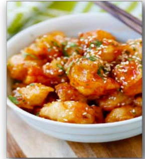
60656-Sweet Thai Chili Chicken 9lb case | $64.00