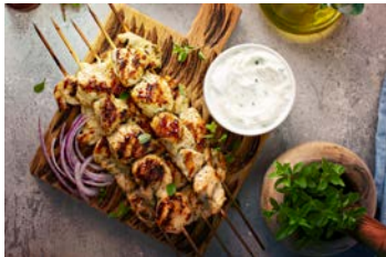
*61569-Chicken Souvlaki Skewers 20 Skewers/case | $69.00