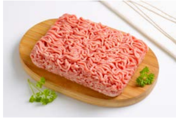
*55731-Ground Pork 5 x 1lb Packages | $30.00