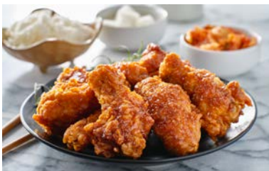
61518- Fully Cooked Chicken Wings 4.4lb bag| $43.00