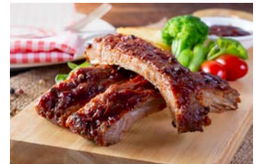
*54854-Pork Baby Back Ribs 11lb case | $72.00