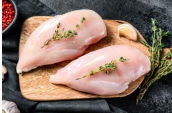
*60190-6oz Natural Chicken Breast 5.5lb case | $67.50