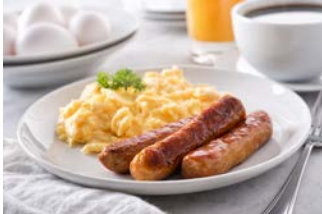
*58052-Breakfast Sausage 60pc/case | $32.00