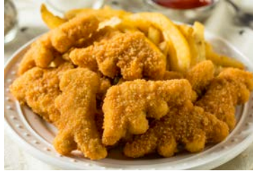
60854-Snakosaur Chicken Nuggets 8.8lb case | $65.00