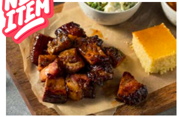
49890- Smoked Pork Belly Bites 2.2lb Bag | $25.00