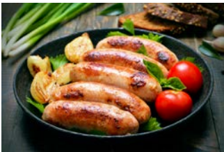
*58064-Sausage Combo Contains Beef, Chorizo, Mild Italian, Hot Italian & Banger Sausage 5lb case | $47.00