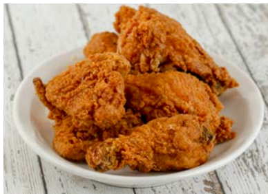
60257-KFC Style Breaded Chicken approx. 18pc/bag | $45.00