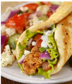
*50888-Pork Souvlaki 4oz 20 Skewers/case | $57.00