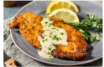
54636-4oz Breaded Pork Cutlets 40pc case | $72.00