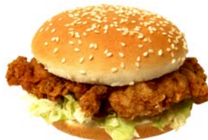
#62274- 5oz Buttermilk Breaded Chicken Breast Burgers Fully Cooked! 8.8lb case (approx. 25pc) | $93.00